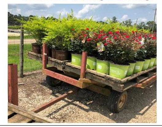
Figure 5. A pulled order for shipping using pallets to more efficiently load and unload.