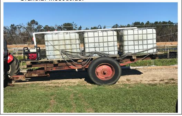
Figure 4. Pest management using Air-Tek Sprayer for liquid application.