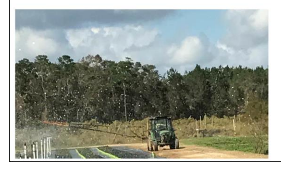
Figure 3. Weed control with liquid herbicide application.